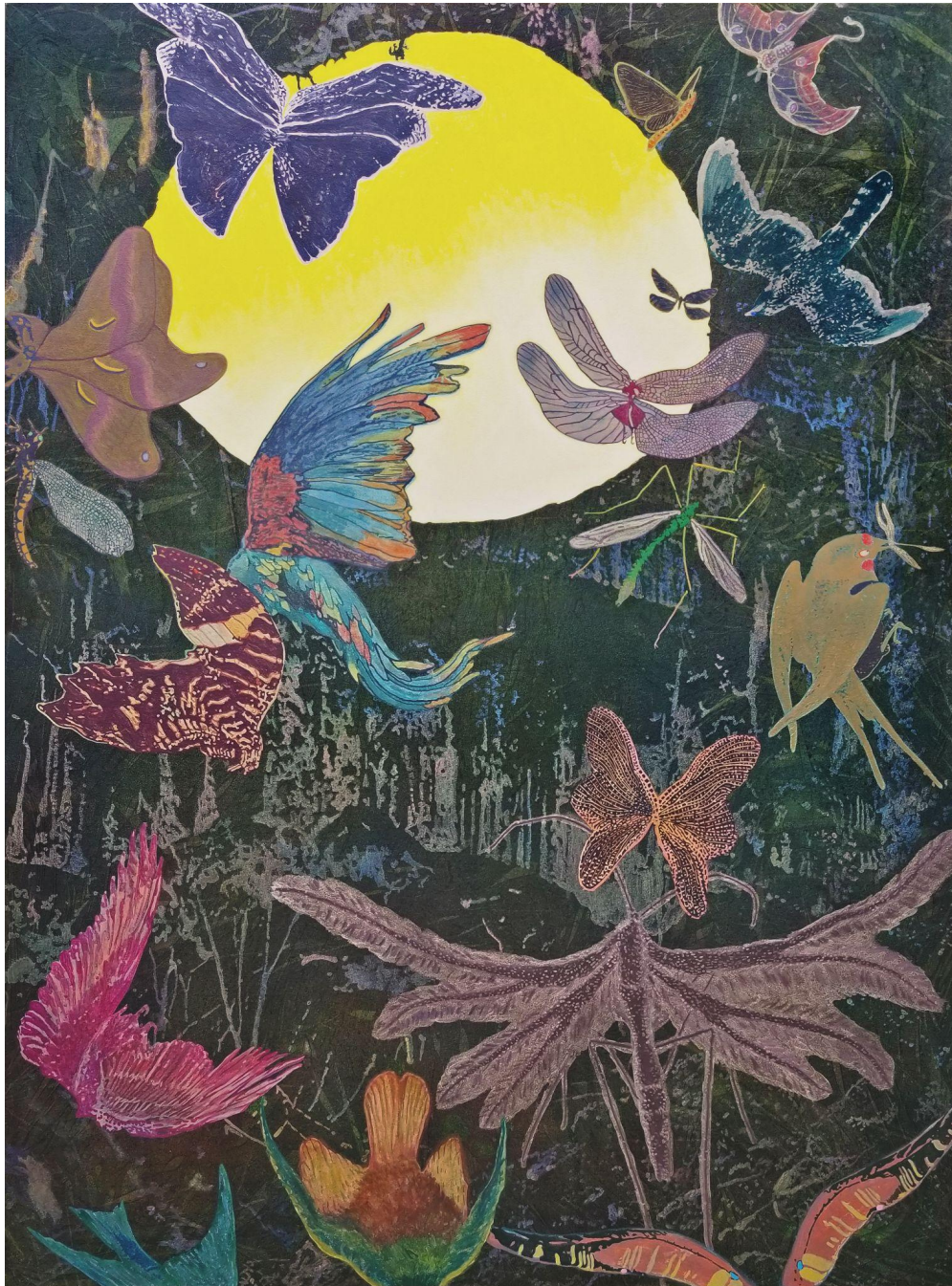
Winged Creatures, 2021