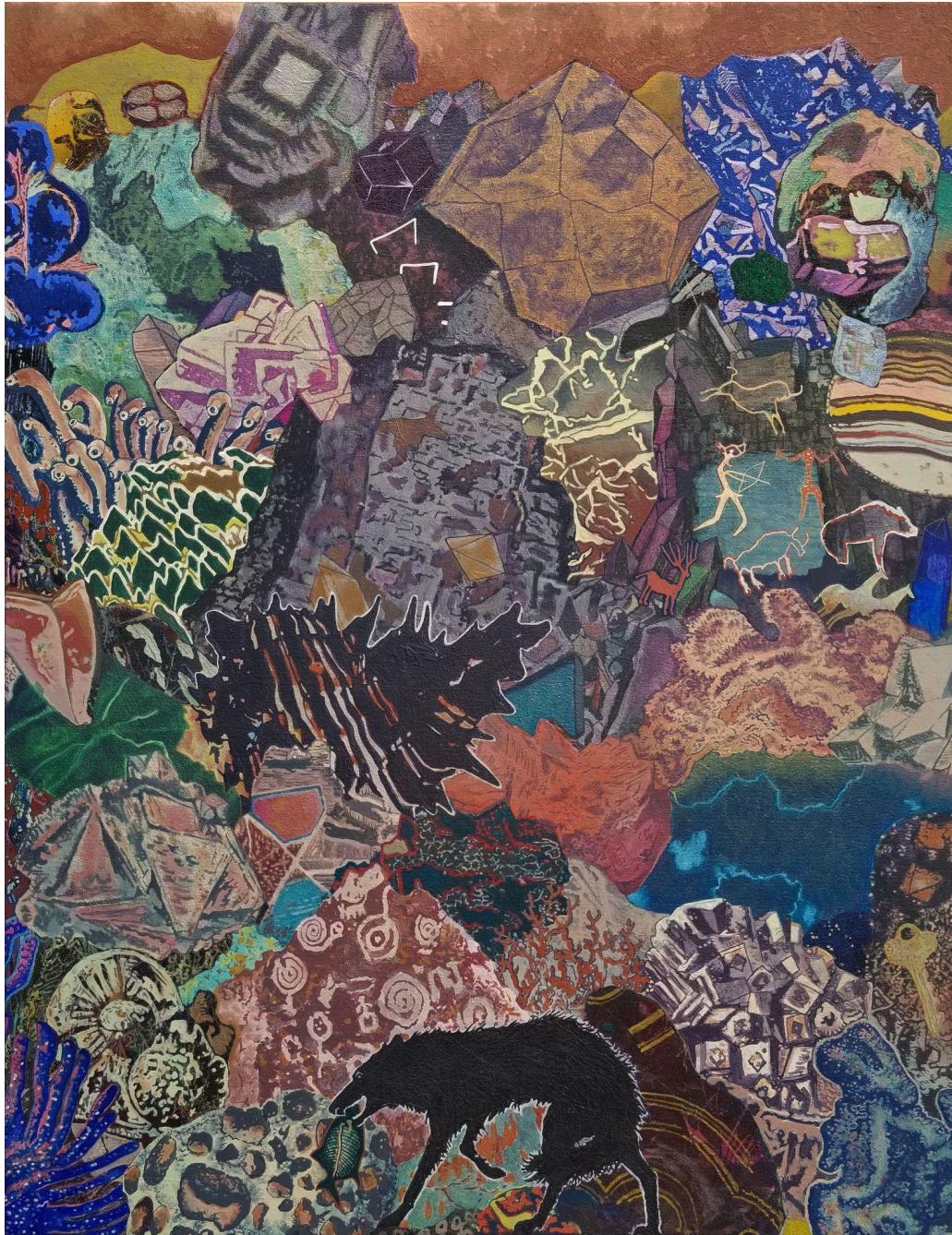
Mineral Mythology, 2021