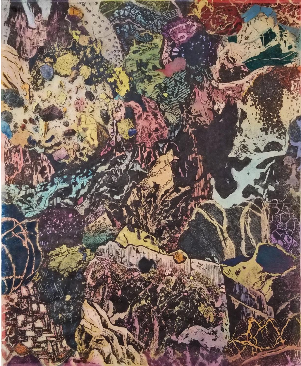
Elements of Geology, 2018

Acrylic, oil, ink and wax on paper 23 x 19"