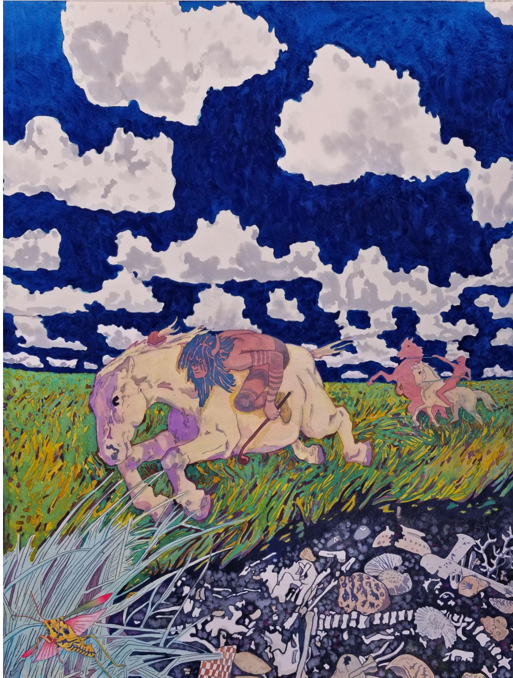
The First Horse, 2021

Acrylic and watercolor on paper 30 x 22"