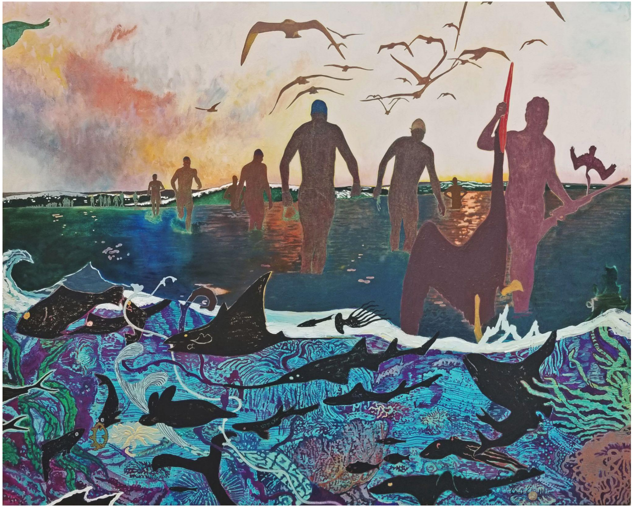
The Sea, 2021