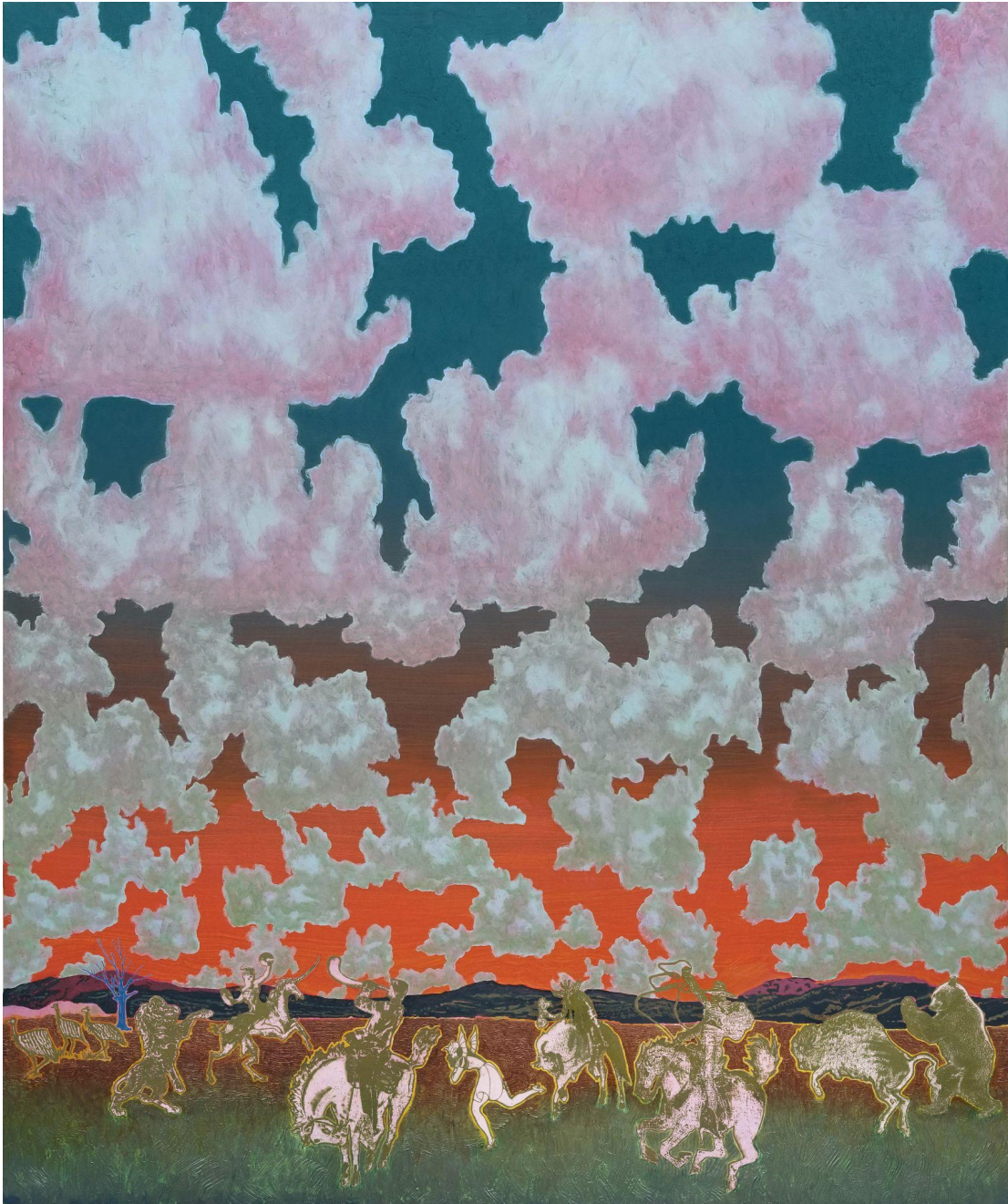
Cloud World (Dancers), 2021