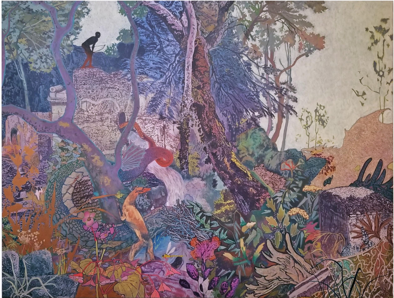
The Dragon's Garden, 2021